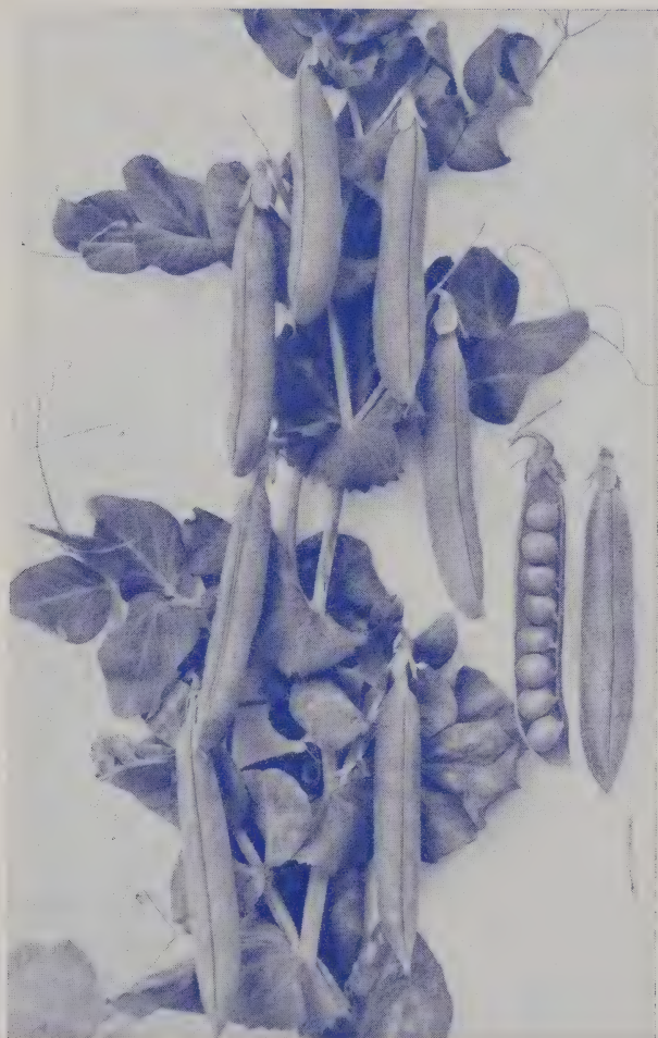
ICER — No. 95